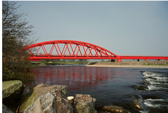
Figure 1 –Figures and figure captions are centered (10pt, italic, 6 pt before and after)